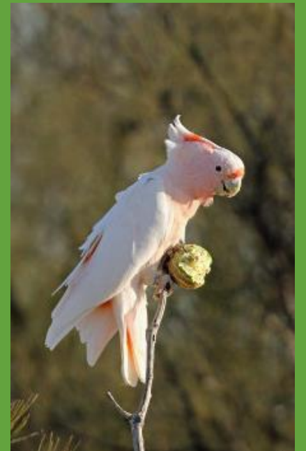
Glossy Black Cockatoo, Major Mitchell's Cockatoo