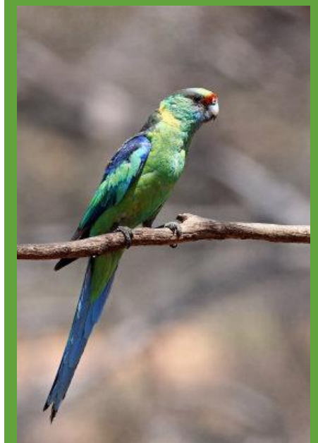
Mulga Parrot, Budgerigar, Australian Ringneck