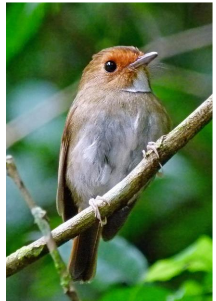
Malaysian Peacock-Pheasant, Rufous-browed Flycatcher