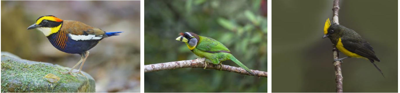
Banded Pitta, Fire-tufted Barbet, Sultan Tit

highly sought-after Malaysian Rail-Babbler, to name but a few. A grand total of 222 bird species were recorded. The full bird list follows at the end of this document. Other sightings of interest included Grey-bellied, Pallas', Plain and Himalayan Striped Squirrel, Three-striped Ground-squirrel, Black Giant Squirrel, Tree Shrew, Common Palm Civet, Silver Leaf Monkey, Long-tailed Macaque, White-handed Gibbon, Eurasian Wild Boar, Indian Muntjac and tracks and dung of Asian Elephant.